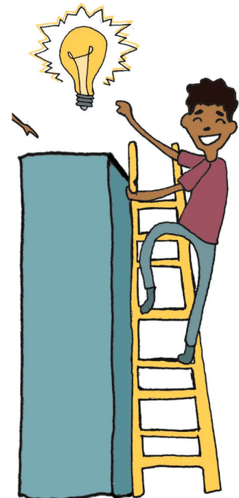
5.) Support Comprehension