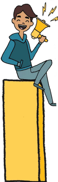
4.) Amplify Language