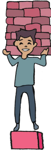
2.) Build on the Experience of Your MLs