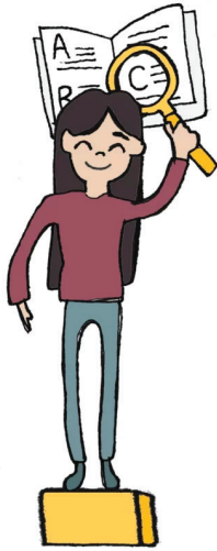
1.) Analyze Academic Language